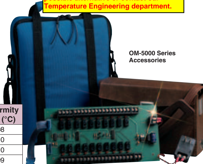
OM-5000 Series Accessories

The OM-5000 series has been discontinued. Please see the DR130 as a possible alternative or contact our Temperature Engineering department.